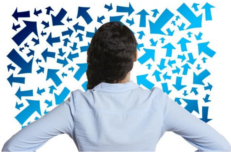
this image by Gerd Altmann via Pixabay website

When you can't control what is happening to and around you. Challenge yourself to control the way you respond to what is happening.